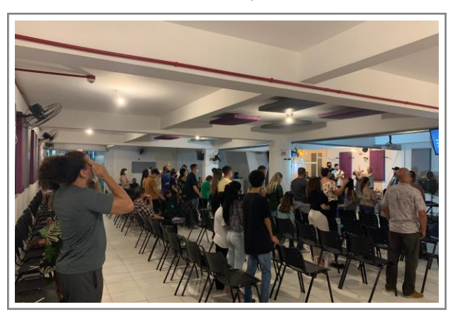
Sunday Evening at Vineyard Floripa