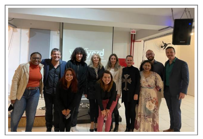
New Wine Discipleship School Graduation