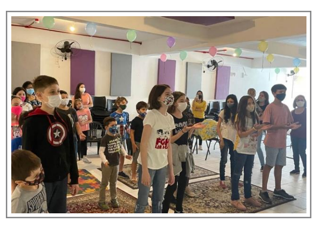
National Children's Day Outreach Event