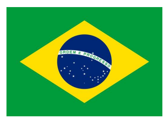
Vineyard Floripa Website: vineyardfloripa.com