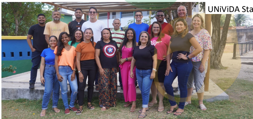
UNiViDA Staff Team