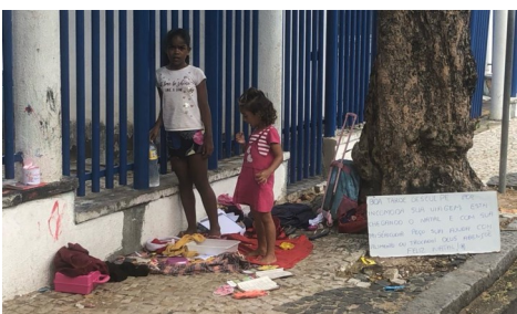
Children begging alone at the side of the road